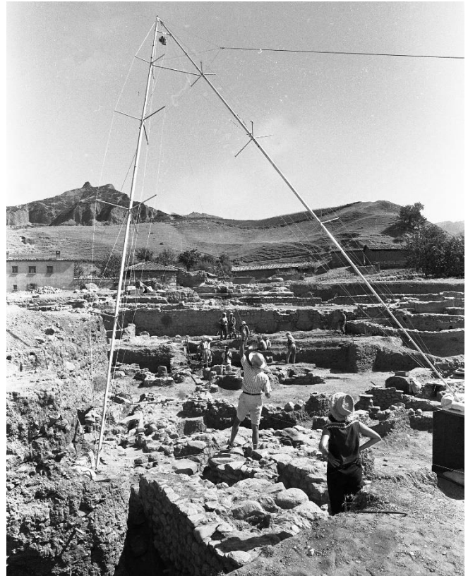
Figure 3. The Whittlesey Bipod, invented to take aerial stereo photographs of excavations trenches, in use in 1964 at sector PN. The Bipod was far more controllable than balloon or kite photography, and could be rectified on film to produce stereometric photos and three-dimensional representations. Today we use drones and photogrammetric software for the same purposes (fig. 6).

Among the objectives we have tried to juggle in recent years are the excavation of a terrace in the city center, part of a sanctuary of the Roman imperial cult. At some point the sanctuary was dismantled and its space reused as houses, shops, and a late antique fortification that may have walled off part of the city (partly excavated by Eliza Gettel). Such transformations of urban space are among the most important aspects of late antiquity, and Sardis offers many opportunities to study them. My own interests lie in earlier periods when the Lydians, a native Anatolian people, made Sardis their capital and engaged in an imperial expansion over most of western Turkey. Our current excavations in the Lydian palace offers hope for major new understandings of the relations between Anatolia, Greece, and the Near East at this formative period of history. And conservation and publication remain among our primary foci.